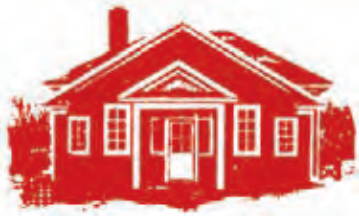
Home of the Little Red Schoolhouse Established 1914