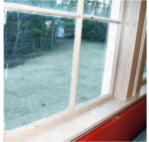
Larsmont Schoolhouse windows in 2013, prior to rebuilding.

An added benefit of the reconstruction was the cleaning of the original bronze handles on the windows, which had long ago been painted over. After the repair and before reinstallation, they also painted the windows inside and out.