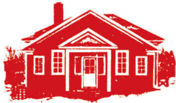
Home of the Little Red Schoolhouse Established 1914

Larsmont Community Club • Early Summer 2014