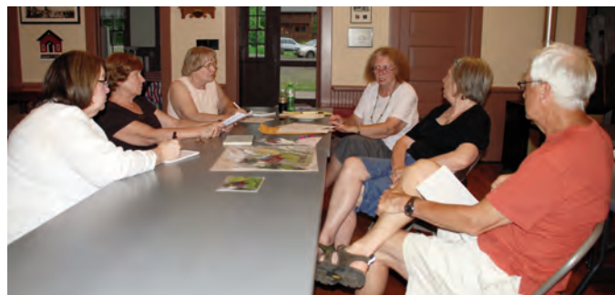
Members of the Larsmont Schoolhouse Centennial planning committee met on July 7 to discuss some of the options available to celebrate the anniversary. Additional members are welcome to help with the plans.