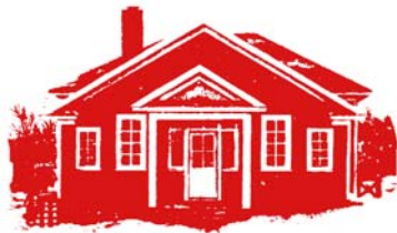
Home of the Little Red Schoolhouse

Larsmont Community Club • Early Summer 2010